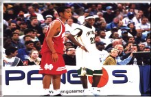
Lebron James - 2003 Pangos Dream Classic