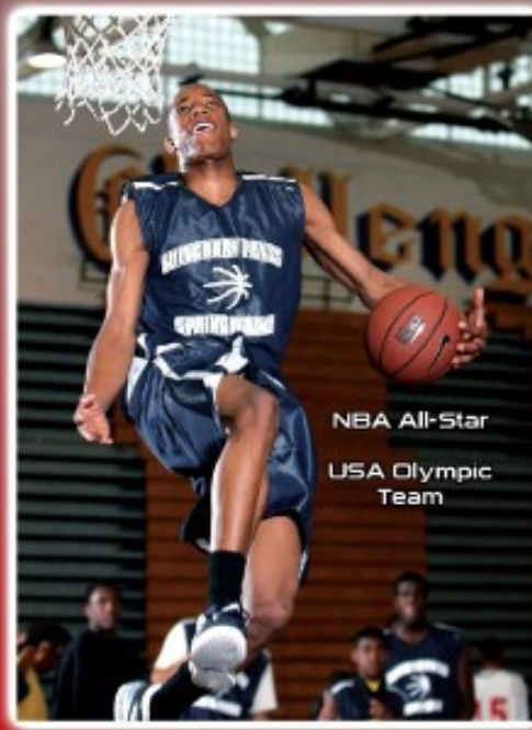
NBA All-Star USA Olympic Team